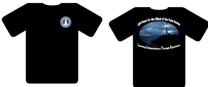
LITE Club T-Shirt image