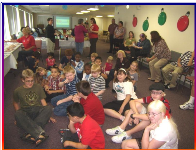
Holiday Party continued on page 2.