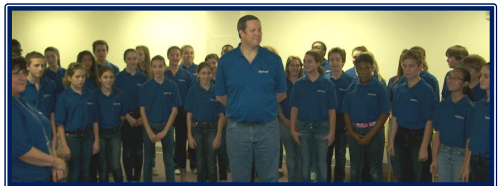
Pictured above: Bak Middle School of the Arts Choral Group.