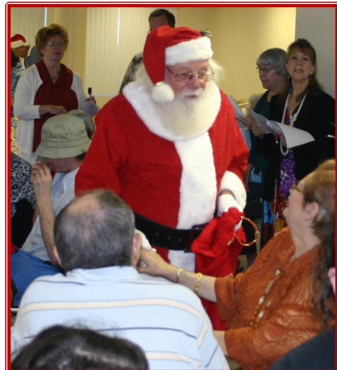
Pictured above: Santa and Carolers visit the Focus Group in December.