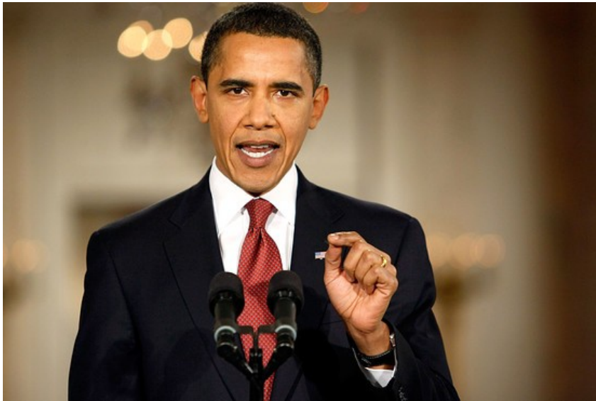
President Obama speaks during a news conference in the East Room of the White House.

The Western Center for Journalism, a Steve Baldwin Exclusive http://www.westernjournalism.com/?page_id=3910