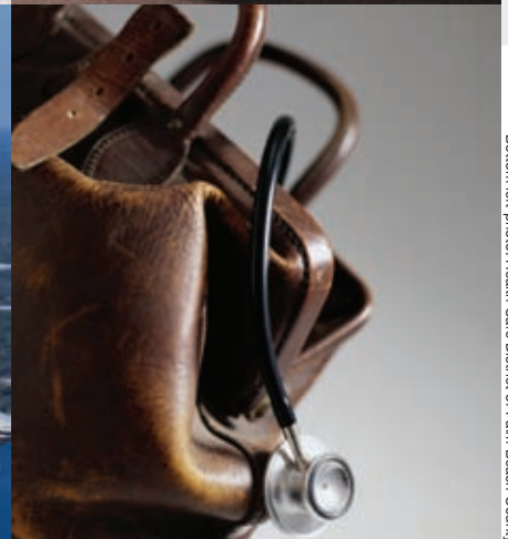
Top left photo: JFK Medical Center Left Middle right photo: Jupiter Medical Center Bottom left photo: Health Care District of Palm Beach County