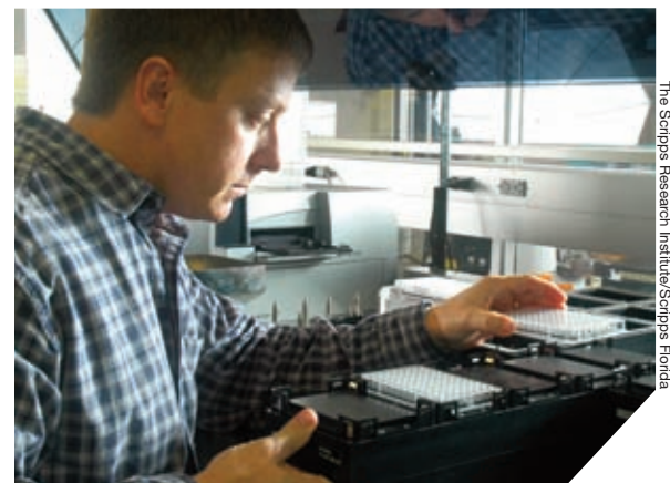
The Scripps Research Institute/Scripps Florida