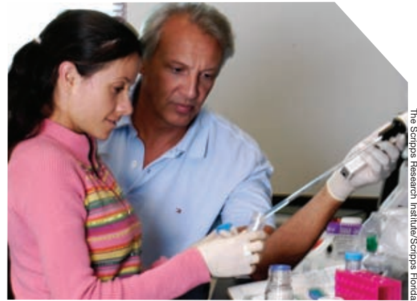
The Scripps Research Institute/Scripps Florida

Spurred by the arrival of Scripps Florida and Max Planck Florida Institute, a number of life science companies are moving to Palm Beach County, adding to the vitality of this well-established industry sector. Currently, more than 140 area companies are focused on the discovery and advancement of drugs and pharmaceuticals, medical devices and equipment, research and testing.