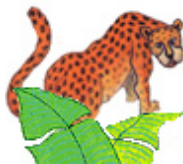
Osebo the Leopard

He presents not only the drum to Nyame, but Osebo himself! Nyame asks the little turtle what he would like in return. Akykiegie the Turtle asks for a hard shell to protect his back from the sharpness of the claws of Osebo the Leopard. And that is the creation story of how the turtle got its shell. The theme of this story is that in life, wits may be more powerful than size or strength. This is an important lesson for children who may feel vulnerable, yet can be clever and know how to accomplish many things.